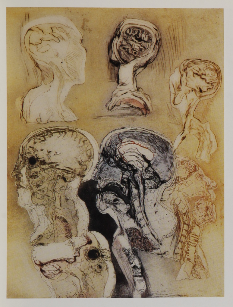
"SAGITTAL SERIES 1/10" Intaglio etching, 18"x24"