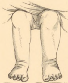
The same case immediately after operation (also from a photograph).

November 17, 1894. The deformity in this case is shown in the accompanying illustration. The details of both operations were similar. After tenotomy of the tendo Achillis, though the equinus element was almost absent, an incision two inches long was carried down to within half an inch of the external malleolus. The fibula, having been stripped of periosteum, was prepared out and three-eighths of an inch of its shaft excised with cutting forceps, the lower section being three-fourths of an inch above the lower end of the bone. Forcible abduction of the foot brought the sole beneath and a little beyond. A few strands of drainage were placed in the wound, the limb was dressed antiseptically and placed upon an internal straight splint. A plaster-of-Paris dressing was applied fourteen days later, when