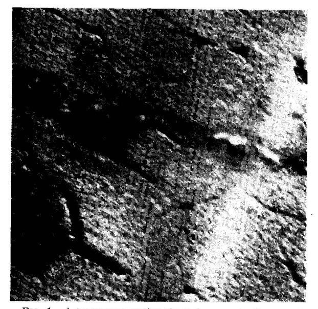
FIG. 1. A transverse section through a muscle fiber nearly normal to the fiber axis showing several myofibrils. Magnification, \times 30,000.

In favorable instances an astonishingly regular macromolecular arrangement can be seen in these sections. At a moderate magnification a section of a fiber cut nearly at right angles to the long axis will appear as in Fig. 1. The macromolecular filaments constituting the myofibrillar blocks are seen almost end-on as either dots or short rods. Their diameters correspond to those of the fila-