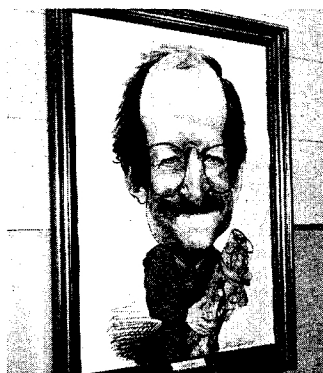
Just after Varmus announced his intention, in fall 1999, to leave NIH, some colleagues put up a mock portrait featuring artwork that had accompanied a New Yorker feature on Varmus. The proto-portrait only remained on view for several days.