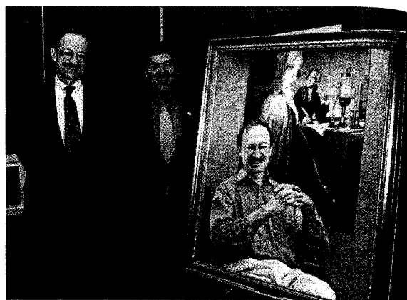
Varmus and Zerhouni stand beside the finished work, which features Varmus sitting before a famous old painting by French artist Jacques Louis David.