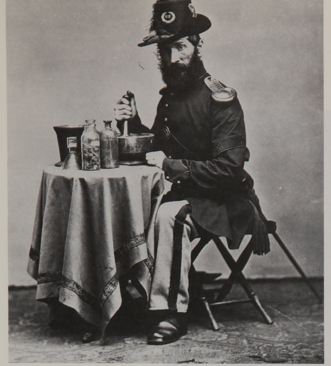
Dress uniform of a hospital steward (pharmacist) of the Union Army during the Civil War period. (The photograph was staged by the United States War Department in 1900.) Hospital stewards both prepared medicines and dispensed them. (NMAH)

n the colonial period, apothecaries in the hospitals were frequently called upon to perform medical as well as pharmaceutical work. By about 1830. however, a few of the larger hospitals had relieved their apothecaries of medical duties and allowed them to specialize in pharmacy. But many hospitals did not employ a pharmacist at all. Physicians dispensed their own medicines, or orderlies or other employees were trained to prepare and dispense drugs.