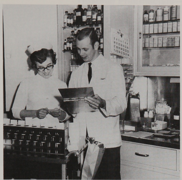
Hospital pharmacist consulting with a ward nurse on patient medications. The presence of the pharmacist in nursing units greatly increased after the 1960s.

t was estimated in the early 1960s that only about fifty per cent of American hospitals had a full-time or even a part-time pharmacist on the staff. By the early 1970s, that figure had risen to 85 per cent. By 1975, ASHP membership stood at over 13,000.