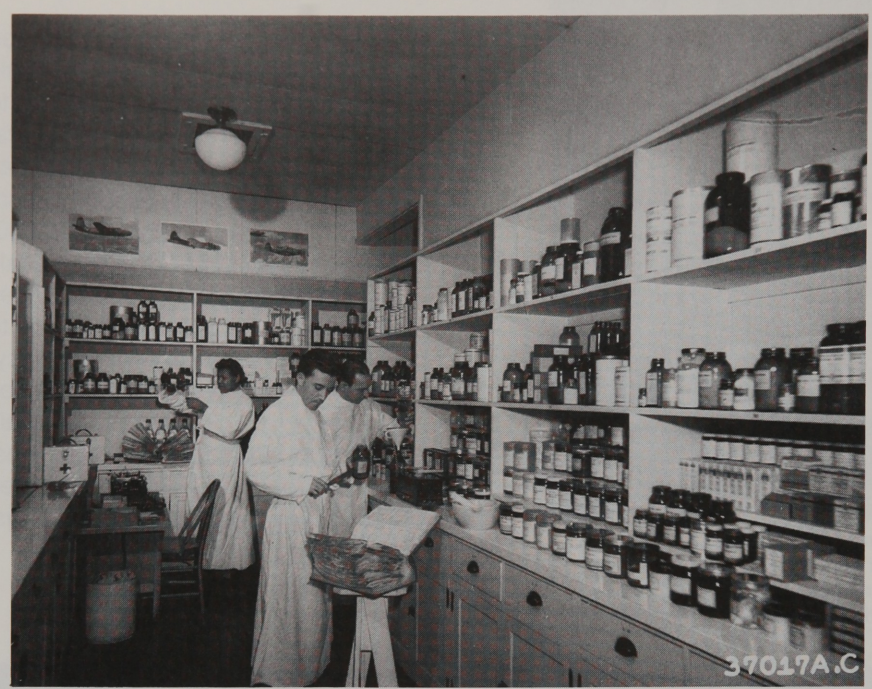
United States Air Force hospital pharmacists of the 1950s compounding prescription orders kept in 19-century style prescription books.