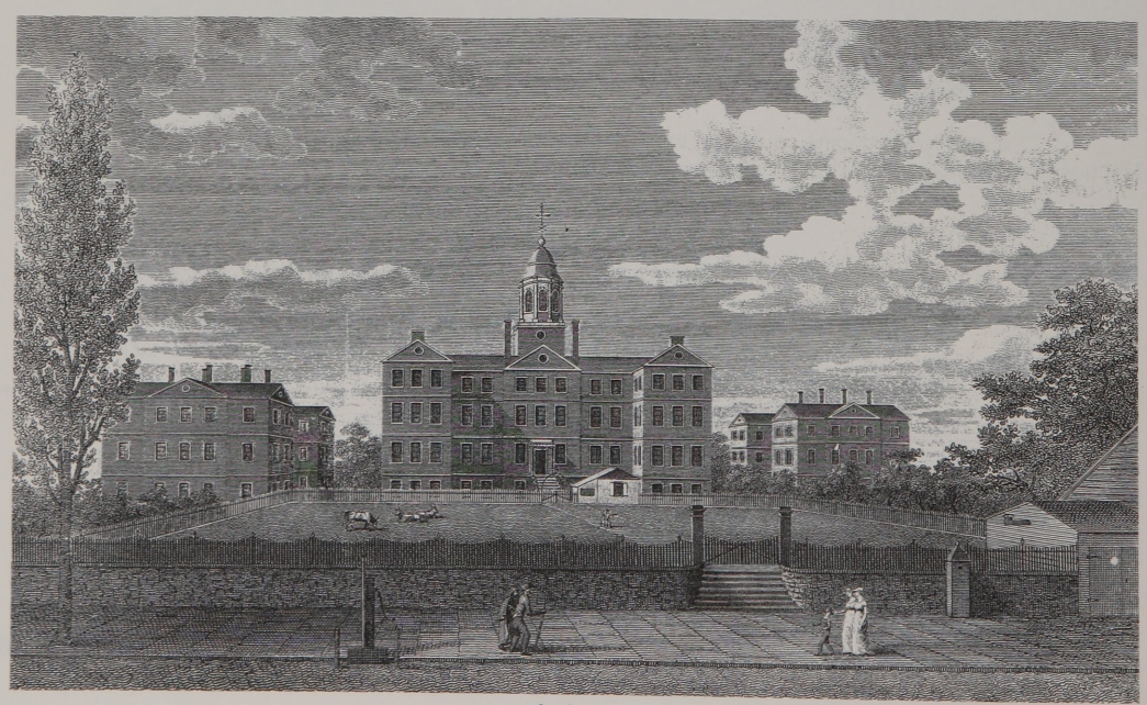
A view of the New York Hospital in the early 19th century. The first American civilian hospital formulary was issued here in 1811.

Thus began the history of hospital pharmacy in America.