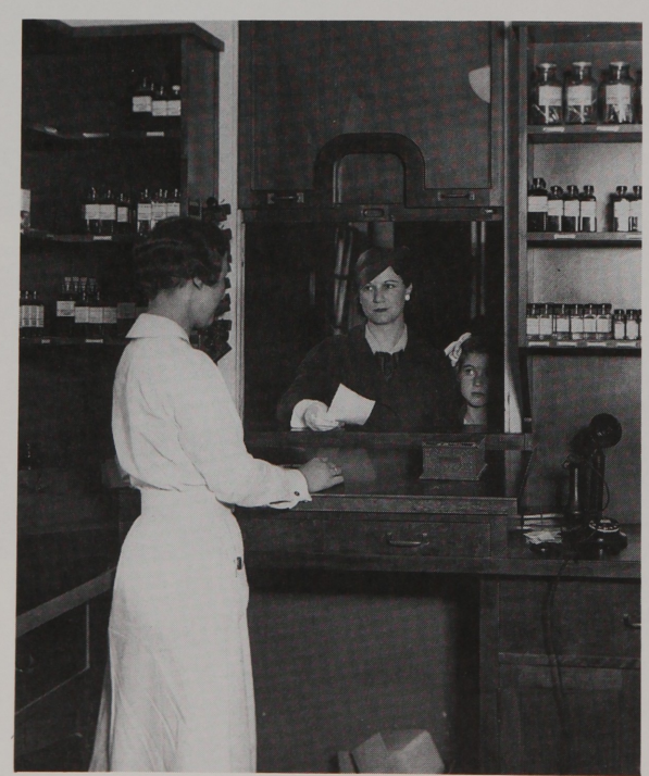
Patient presenting a prescription at the outpatient pharmacy department of the Cleveland Clinic. The telephone had become standard equipment for the pharmacy by the time that this picture was taken, probably in the 1930s.

American hospital pharmacists of the nineteenth century received relatively little recognition for their work. and were generally paid less than community pharmacists. The hospital pharmacist was often buried in a basement "drug room." with little opportunity for contact with patients or other health professionals. As late as 1922, one hospital pharmacist lamented in the Bulletin of Pharmacy: "If you are not physically above average, do not want to act as a go-between for physician and patient. do not want to try your hand at teaching and do not want to do all kinds of odd jobs from dressing cut fingers to pulling teeth - stick to what is known as the commercial side of pharmacy. That's where the game is worthwhile."