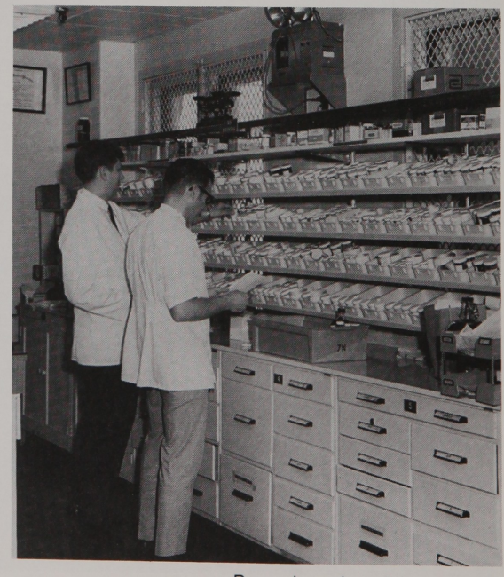
Prepackaged medicines were in common use by the 1960s, saving these two hospital pharmacists time in dispensing.

The tremendous growth in the number of hospitals. and their increasingly important role in the health care system, was one of the factors that helped to strengthen hospital pharmacy as the twentieth century progressed. The movement to develop and improve standards for hospitals exerted a positive impact on hospital pharmacies. In 1936, for example, the American College of Surgeons adopted a set of minimum standards for hospital pharmacies that had been drawn up by two prominent hospital pharmacists. In that same year, the American Hospital Association formed a Committee on Pharmacy to study the operation of hospital pharmacies.