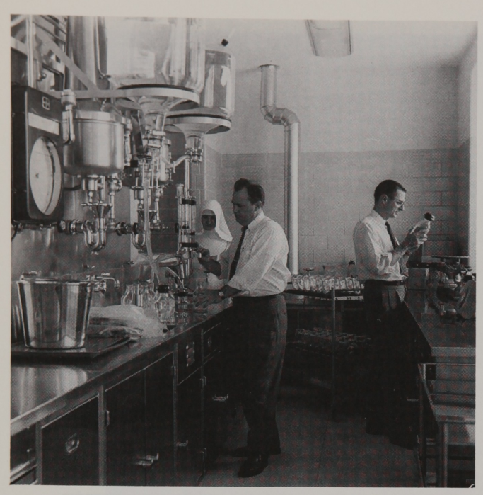
Production of distilled water and the manufacture of large-volume sterile solutions were major tasks for medium and large hospital pharmacies during the 1960s.

The tremendous growth in the number of hospitals. and their increasingly important role in the health care system, was one of the factors that helped to strengthen hospital pharmacy as the twentieth century progressed. The movement to develop and improve standards for hospitals exerted a positive impact on hospital pharmacies. In 1936, for example, the American College of Surgeons adopted a set of minimum standards for hospital pharmacies that had been drawn up by two prominent hospital pharmacists. In that same year, the American Hospital Association formed a Committee on Pharmacy to study the operation of hospital pharmacies.