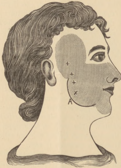
FIG. 2.—Showing area of anæsthesia in Case VI.

Pain ceased from the moment of operation; swallowing, handling, etc., were absolutely painless; the patient gained flesh and spirits. The area of cutaneous anæsthesia is shown in the figure, which can with advantage be compared with those in the article alluded to. It is much larger than in any case yet coming under my observation, and may be due to a division of nerves passing on to the face from the neck, which had been severed by the incision made for