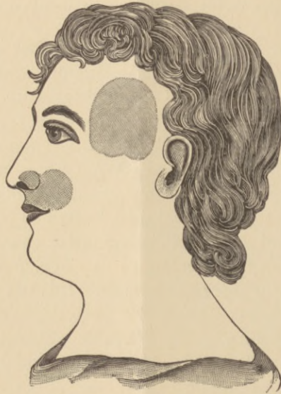
FIG. 1.—Showing areas of anæsthesia in Case V.

Pain ceased from the time of operation. Anæsthesia exists over the upper lip, skin, and mucous surface, incompletely of nostril, skin, and mucous surface. The skin from the infra-orbital foramen to the angle of the mouth is anæsthetic. The mucous membrane lining the left cheek has diminished sensibility, but not entire abolition of the same. No loss of taste; thermic sense normal.