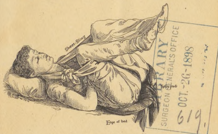
A simple harness for forceps operations.

The crutches devised to steady the flexed lower limbs during operations do their work well, but are too cumbersome to carry. The plan shown in the sketch is a satisfactory substitute. A sheet is rolled and passed behind the neck and under the bent knees, and the thighs are flexed as far as possible. The extreme flexion of the knee gives the ham such a solid grip on the sheet that no sidewise slipping can