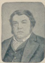
THE LATE LAWSON TAIT whose approval of UNGUENTINE has suggested its introduction in GREAT BRITAIN.

What is it - & how can I get it! Lawson Tait