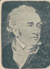
SIR ASTLEY COOPER, BART., originator of formula of COOPER'S ALUM OINTMENT now known in its improved form as UNGUENTINE.