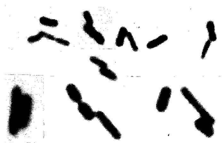
Figure 1. Conjugal pairs, from smear stained with crystal violet. Figures 1, 2, and 3 are at various magnifications; the transverse diameter of the bacteria is about 1 \mu .

The pairs were isolated to individual droplets. After about an hour, they would disjoin spontaneously, sometimes dividing meanwhile. The