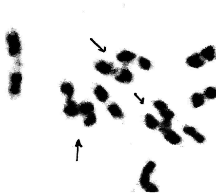
Figure 3. Conjugal pairs? Giemsa stain after acid hydrolysis and osmic fixation. The F - culture in this mating is also from strain K 12.

of the pairs gave viable clones from the F - exconjugant, of which 66 included recombinants as well as the original F - parental combination; 51 of these 66 pairs also engendered viable (and unaltered) clones from the Hfr exconjugant. Control platings of the whole mating population showed that fewer than 1 per cent of the total F - cells were Lac + S r recombinants (Lac + from Hfr; S r from F - ). The distribution of recombinant types was strongly biased in favor of the F - parent. While 63 of the clones included Lac + S r , among other recombinants, only one (still Lac - S r ) carried the Gal 2 and Hfr markers of the Hfr parent. As discussed elsewhere ( Science , 122 , 920, 1955), haploid segregation data are ambigu-